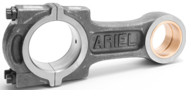
Rigid Conrod With Bronze Bushing

This family of separable reciprocating compressors readily couple with a wide range of high-speed engines. The Ariel JGM and JGP are known for their cost effectiveness and are well suited for gas gathering, gas lift and CNG applications.