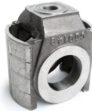
Rugged One-Piece Crosshead