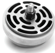
Application-Specific Efficient Valves