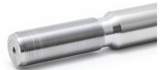
Ariel "Necked-Down" Piston Rod Design